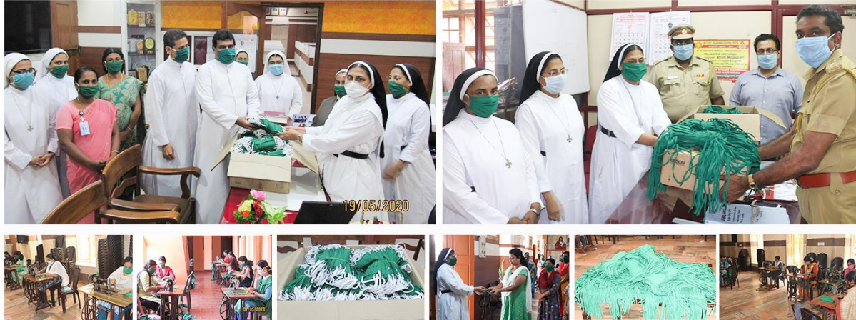
St.Mary's College, Thrissur made & distributed safety Masks to R.T.O.-Thrissur, Jubilee Mission Hospital-Thrissur.

During the pandemic age of Covid 19, St. Mary's college Thrissur extended its responsibility towards the community by making masks and supplied it to public like students, traffic police and Jubilee mission hospital staff. 4000 masks were made by the administrative staff of the college during the month of May 2020. Masks were distributed from 19/ 5/2020 to 29/5/2020.