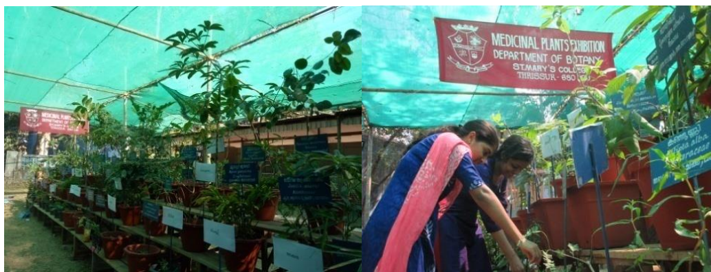
Stall on medicinal plants

Dept. of Botany arranged a stall on medicinal plants in the Flower Show conducted by Thrissur Agri-Horticultural Society held at Thekkinkad ground on 19 th January 2018.