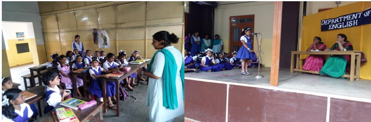
Story Telling Workshop at Sacred Hearts E.L.P.S,