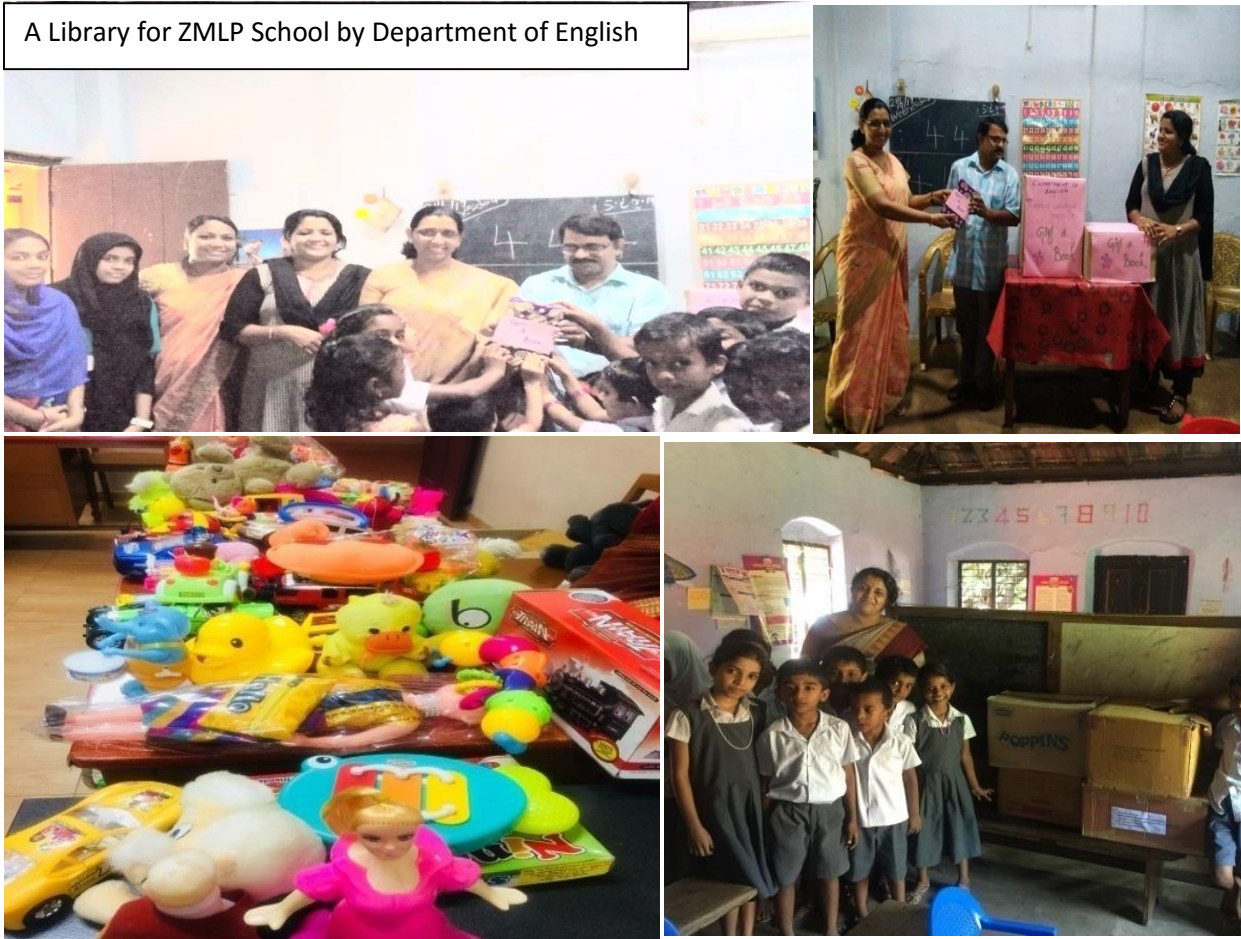
A Library for ZMLP School by Department of English

To instill social commitment in our students, two novel schemes, gift a Book and Gift a Toy were implemented on 22 nd June 2017. The objective of these schemes was to lend a helping hand to the lesser privileged in the society. Old books and toys in good condition were collected and a Library and a Play Corner were set up in ZM L. P. school, Kolazhy, a school with limited financial and infrastructural resources.