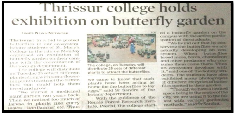
Times of India, 30 th October 2016