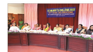
Mega Women's Meet, Celebrating the excellence and social commitment of seven women gems of the society.