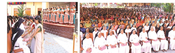
Aadaranceeyam, an event to honour the dedicated services of the former staff of the college was conducted on the Grand Jubilee day