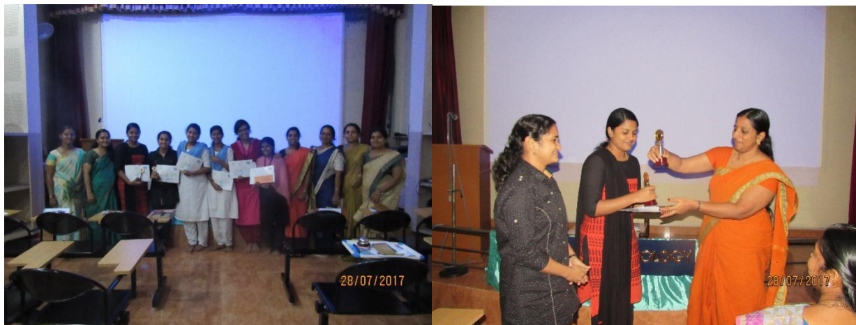
Inter University Powerpoint Presentation Competition