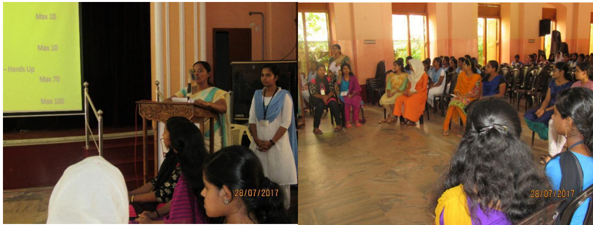
Inter University Quiz Competition