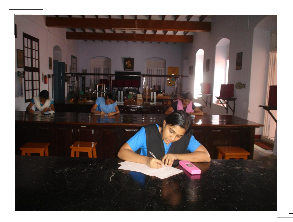
Science Essay Writing Competition