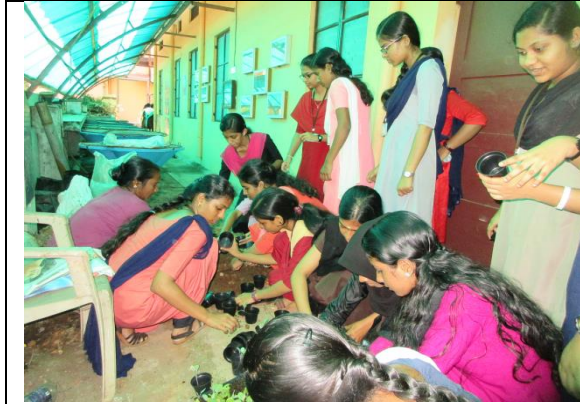
Raising of seedlings