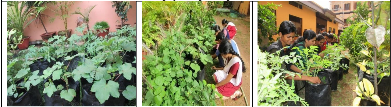
Club members maintaining the vegetable garden