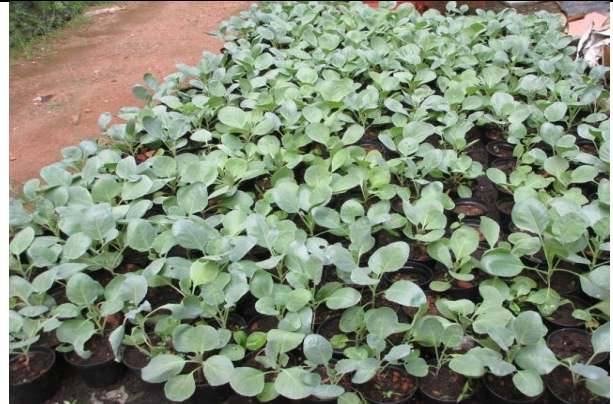
Seedlings ready for sale