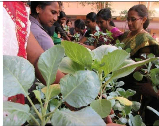
Selling of seedlings