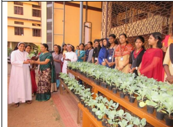
Inauguration of sale by Principal