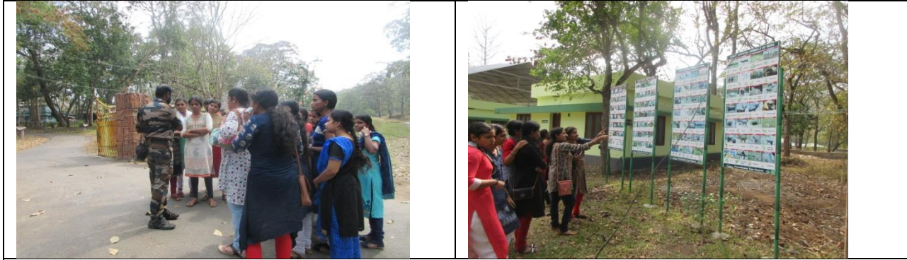
Nature trip to Parambikulam