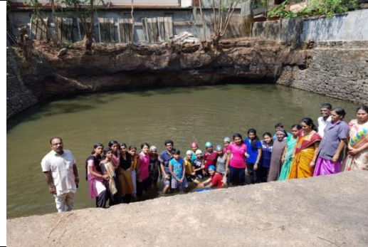
Pond after cleaning