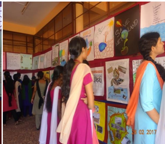
students watching the exhibition