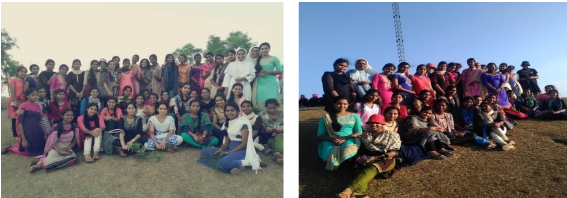
In mesmerizing meadows