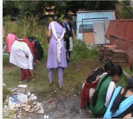
Planting of tree saplings in the college campus