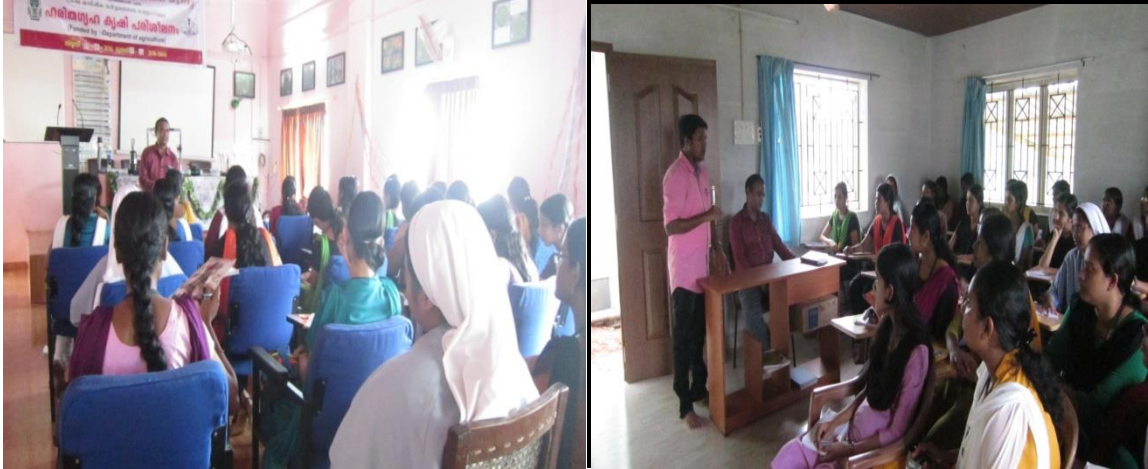
Class on organic farming and biocontrol methods