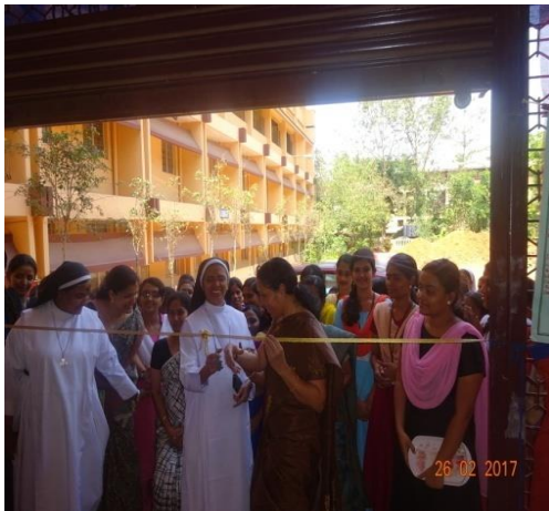
Inauguration of the exhibition

An exhibition on “wetlands and their importance” was arranged on 27 th Feb-2017 as part of one month long activities of World Wet land day celebration.