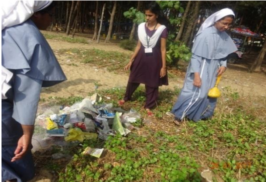
Cleaning - Azhikode wetland

A trip was conducted to Kanimangalam kole and Azhikode wetlands on 27 th January 2017 to experience the features of wetlands. The visit included oath taking for protection of wetland, cleaning of wetland and human chain formation in Kanimangalam Kole land.