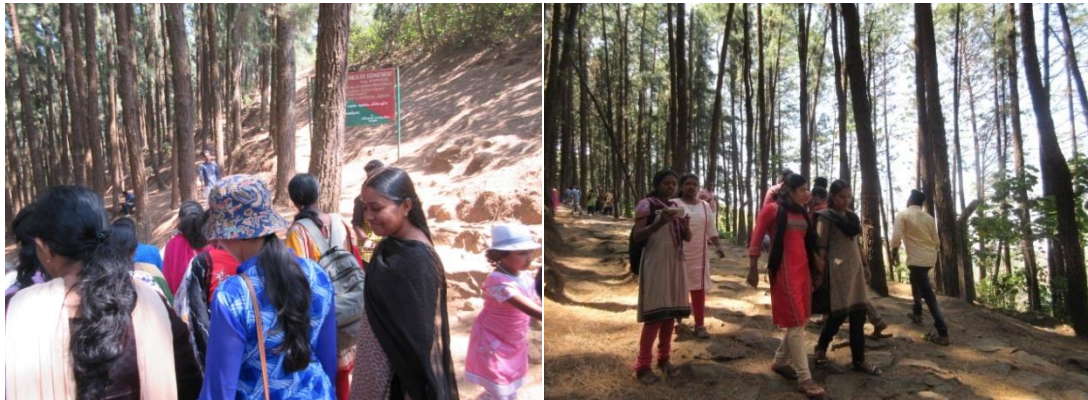
In pine forest enjoying its coolness