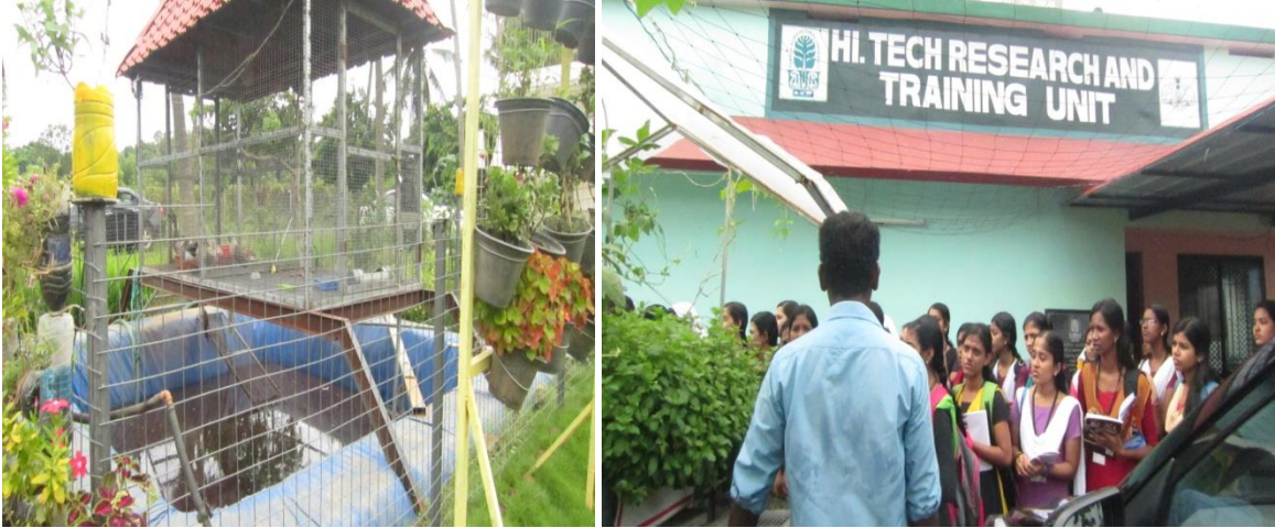
Visit to integrated farm unit