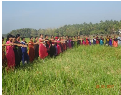
Oath taking –for protection of wetlands