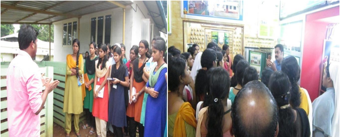
Visit to biocontrol unit and Museum of Forestry Dept.